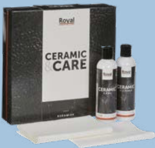
CERAMIC CARE KIT

Before using your marble table, we recommend applying an additional protective layer. This is to prevent stains from soaking into your marble. We offer the Ceramic Care Kit for this purpose. Before using the furniture, apply the Ceramic Care . You can apply the Ceramic Care with a soft cloth. Apply this layer twice for optimal protection.