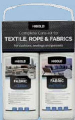
HIGOLD TEXTILE ROPE & FABRICS CARE KIT

Before using your furniture, you can apply an extra layer of protection with the Protector from the Higold Textile, Rope & Fabrics Care Kit . This will create a protective layer on your upholstery and keep your upholstery in top condition. The Protector comes in a spray can and can be applied to the upholstery with this. Spray the Protector onto the fabric in even lines.