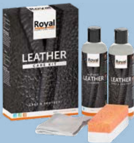
LEATHER CARE KIT

Before using your furniture, you can apply an extra layer of protection to the leather with Care & Protect from the Leather Care Kit . This will create a protective layer and keep your leather in top condition. Apply Care & Protect to a lint-free cloth and rub the leather cream onto the surface and spread it evenly. Let it dry for 15 minutes and then rub with a clean cloth.