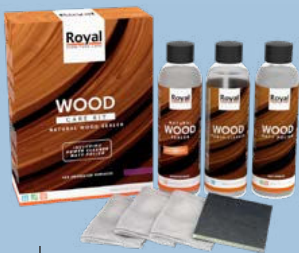
WOOD CARE KIT

Before using your wooden furniture, we recommend applying an extra layer of protection. We offer the Wood Care Kit for this purpose. It contains a sealer, cleaner & polish . Before using your furniture, apply the Natural Wood Sealer with a soft cloth. Apply two coats for optimal protection. Let each coat dry for 30 min and sand the first coat with a scouring pad before applying the second coat for optimal results.