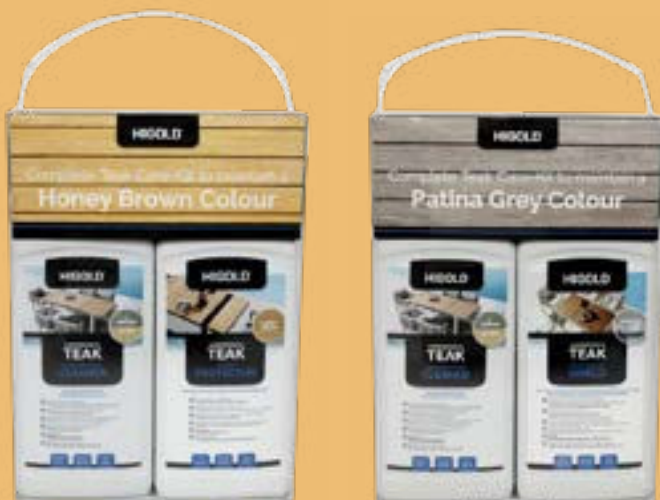
HIGOLD TEAK CARE KITS

When stains or soiling occur on your teak furniture, we recommend using the Teak Cleaner from the Higold Teak Care Kit . Apply the Teak Cleaner with a cloth and let it soak in for a while. Then rub the dirt off your furniture. Note! Always rub with the grain of the wood. When you have removed the dirt and the cleaner has penetrated, you can apply a new protective layer with the Teak Protector , so your furniture is optimally protected again. Repeat this treatment 2 to 4 times a year for optimal protection.