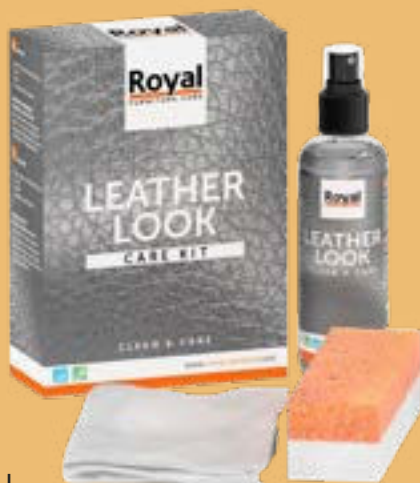
LEATHER LOOK CARE KIT

The Leather Look Care Kit contains two products for cleaning your imitation leather; Care & Protect and a Double Action Sponge . For light soiling of your imitation leather, use the Double Action Sponge . It has two sides; the orange one for normal cleaning and the white one for heavy soiling. With this sponge, you can gently brush the artificial leather until the dirt disappears and the original look of the artificial leather is restored. For heavier soiling, we recommend using Care & Protect . Apply the lotion to a lint-free, clean white cloth or flannel. Clean in circular movements. Take a clean part of the cloth with each new area.