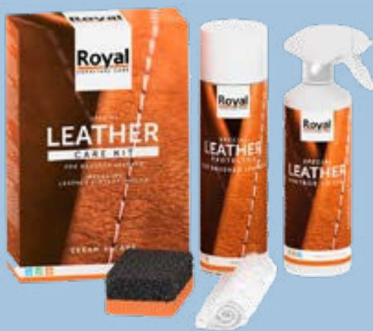
BRUSHED LEATHER CARE KIT

The Brushed Leather Care Kit contains two products for cleaning your sanded leather; Vintage Lotion and the Nubuck Sponge . For light soiling of your sanded leather, use the Nubuck Sponge . With this sponge, you can gently brush the leather until the dirt disappears and the original appearance of the leather is restored. For heavier soiling, we recommend using Vintage Lotion . Apply the lotion to a lint-free, clean white cloth or flannel. Clean with this in circular movements. Take a clean section of the cloth with each new area. Let the leather dry completely and reapply Leather Protector for a new layer of protection on your leather.